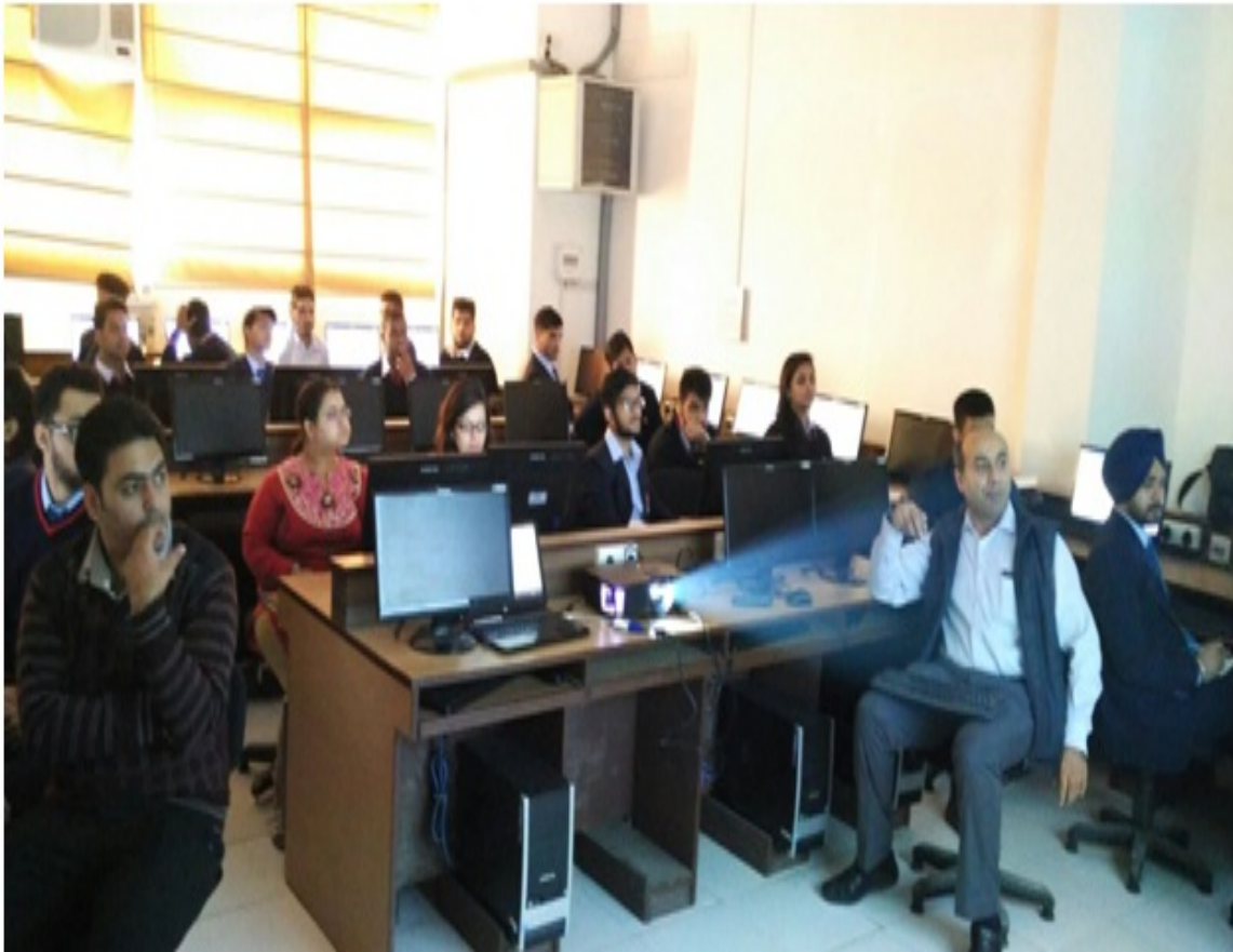
Workshop on Data Enabled Business Intervention