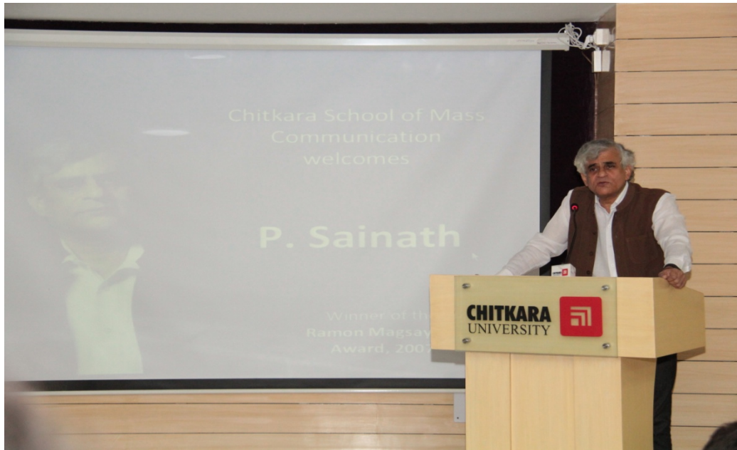
P. Sainath, Ramon Magsaysay Awarded while interacting with the students