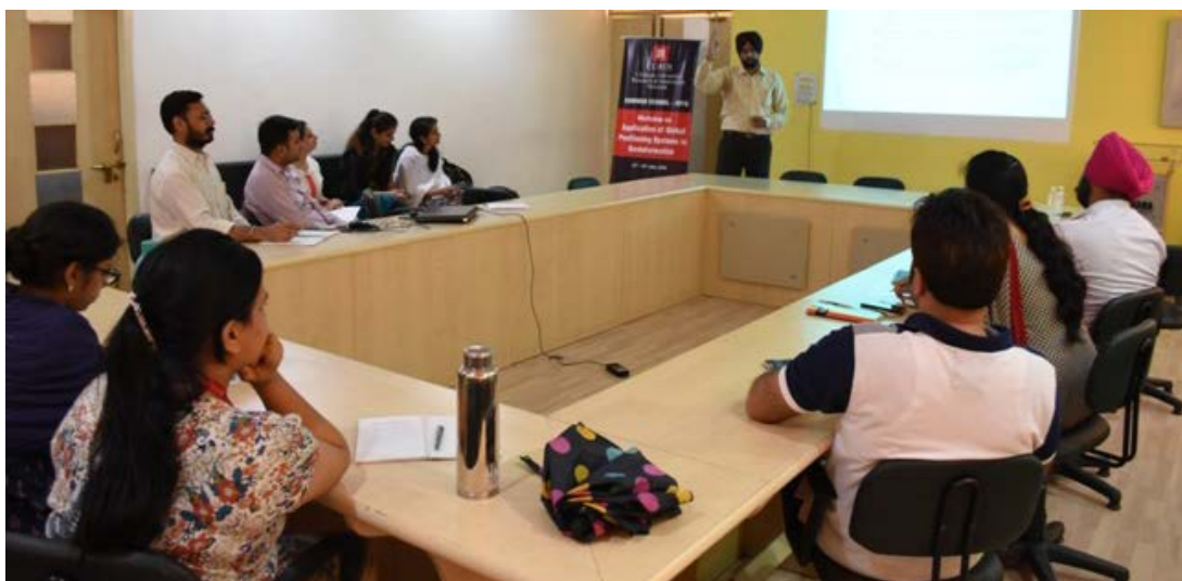
Workshop on Application of Global Positioning Systems in Geoinformatics

The workshop offered an opportunity to the participants to gain an insight to the geoinformatics. A demonstration of using the Open Street Maps (OSM) was also given to the participants.