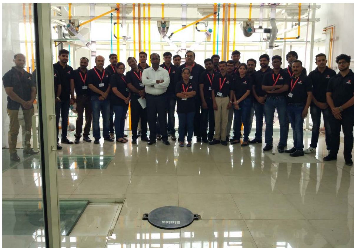
Training session for students

Some of glimpse of Expert Talk are as follows: