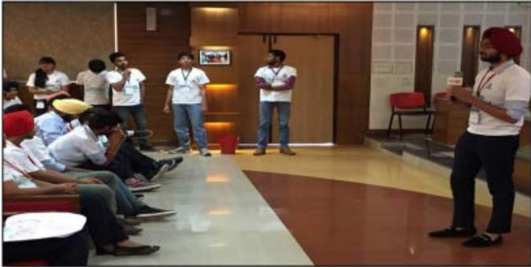
Participants pitching their during Startup Weekend