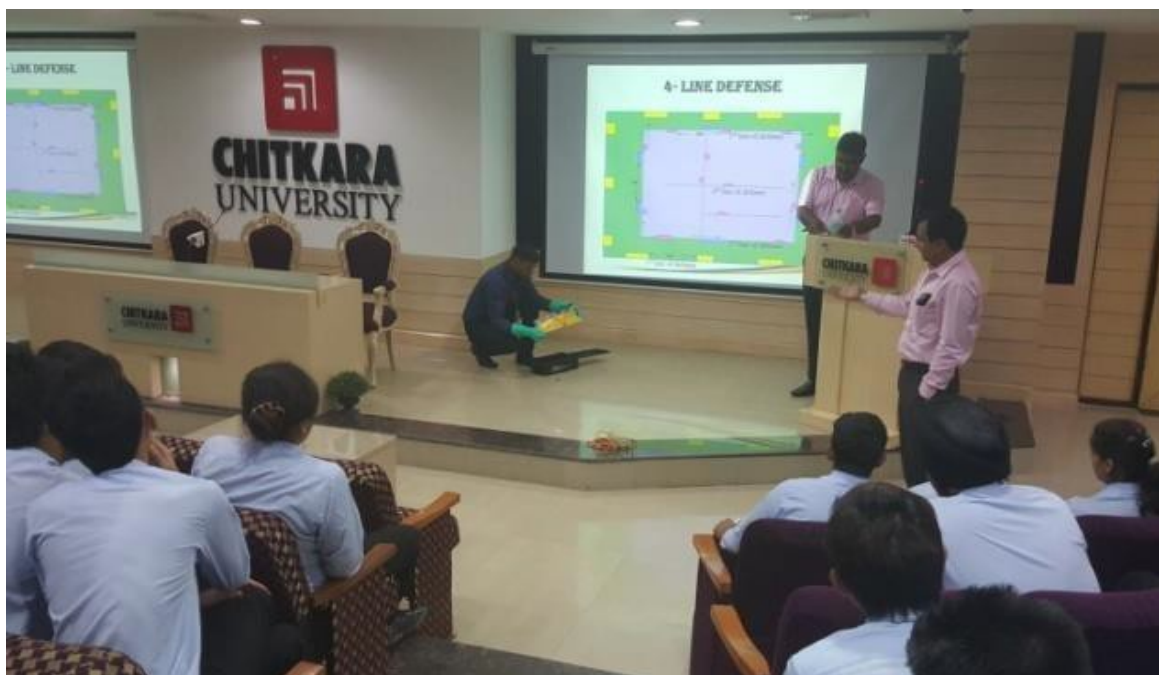
Workshop Session on "Pest control"