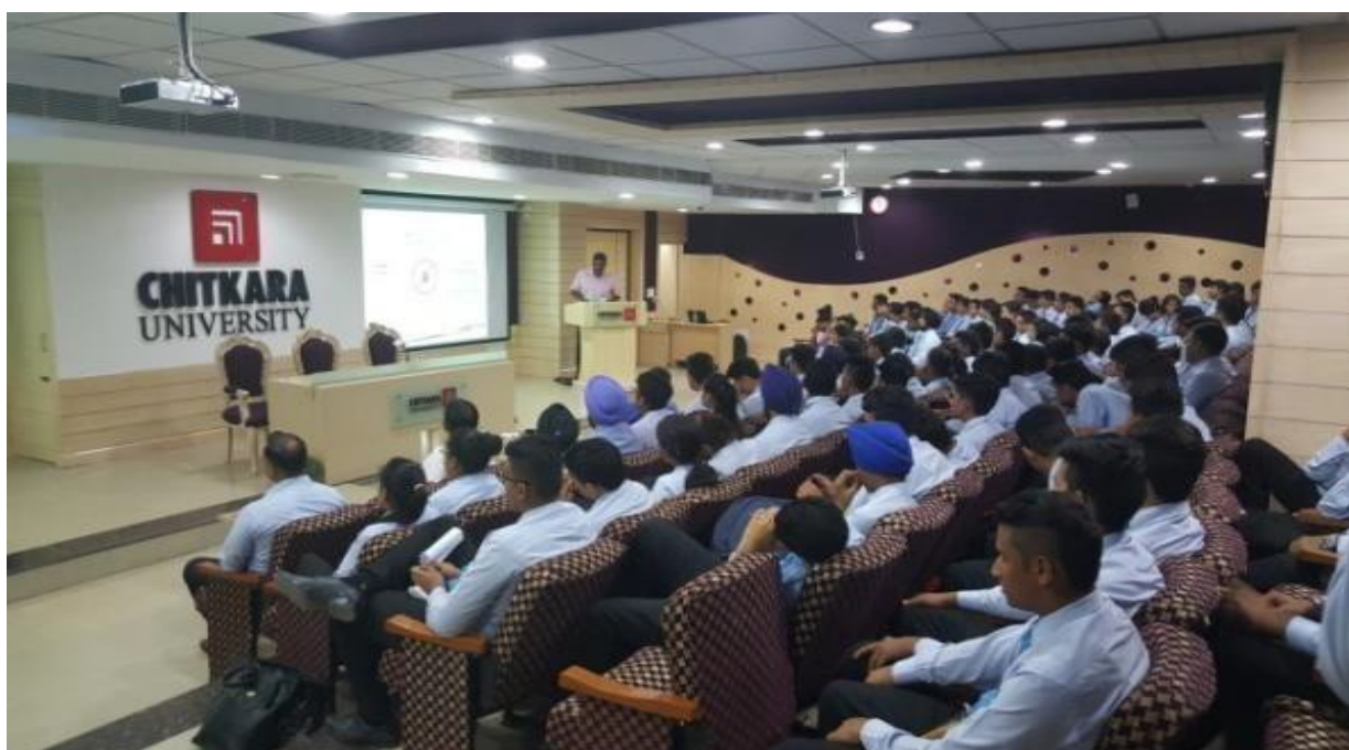
Students diligently attended the workshop

Workshop aimed to educate students about the importance of pest control in Hospitality industry. Students also learned about various types of pest that can be prevalent in hotels and their eradication process. Students were given live demonstration with the equipment’s used for pest control. Pest control is very important to the hospitality industry. Failure to control pests can lead to serious legal consequences including the closure of the premises, fines and prosecutions, and catastrophic drops in food hygiene rating scores; all of which can lead to poor publicity and sales plummeting. It was very informative and knowledgeable workshop in which 60 CCHMC students participated.