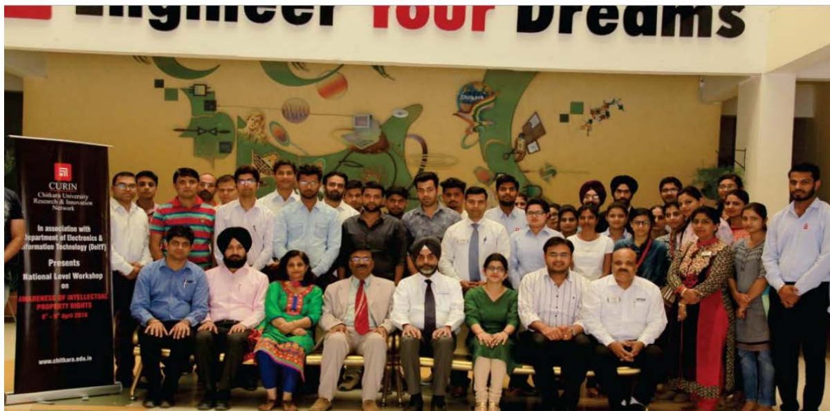
Workshop Participants and experts on Day 2 of the workshop