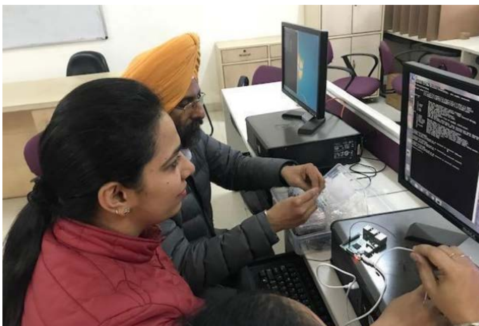
Workshop on Raspberry Pi

Description of the event: Department of Electronics and Communication Engineering has organised two days workshop on Raspberry Pi. A total 18 faculty members were participated in the event. The main motive of the workshop is to familiarize the participants about the topics such as: Introduction to IoT and embedded systems, IoT devices raspberry pi and node MCU, GUI designing cloud server, database, API, web services, handshake, data analytics and visualization.