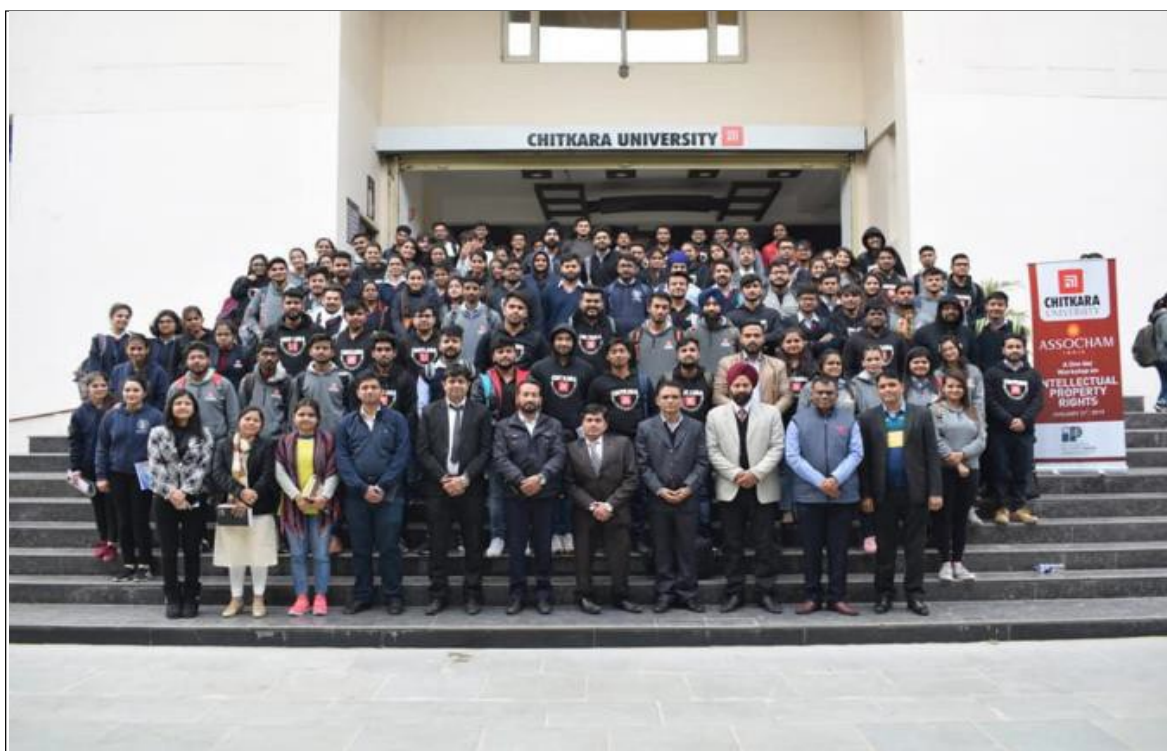
Participants and Resource persons of Assocham sponsored workshop on Intellectual Property Rights

Total 120 participants participated in this workshop.