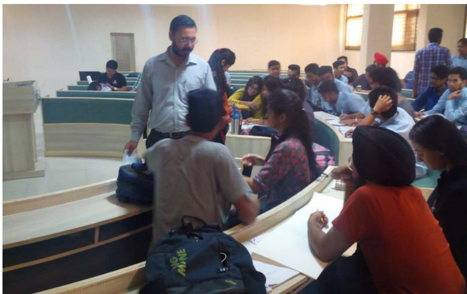
Students being guided during the workshop

A One-Day Workshop on "Programming Concepts" organized by Department of Computer Applications, CUIET, CU Punjab on October 08, 2015. The workshop was organized with an intent to improve the logic building skills of students of BCA and BCA-MCA (Integrated) courses. Certain important concepts, that form the foundation of the software programming, were discussed during the workshop. The students were also appraised regarding the life cycle of software program, good programming practices, importance of structured and modular programming, and application of iteration in programming. Stress was laid on development of programming logic through hands-on assignments wherein the participants were required to design algorithms and flowcharts for the given problems. The workshop was coordinated by Mr. Preetinder Singh Brar. The resource persons for the workshop were Mr. Vikram Mangla (Dy. Dean, Department of Computer Applications, CUIET, CU Punjab), and other senior faculty members of the department including Mr. Maninder Jit Singh Khanna, Associate Professor, Mr. Preetinder Singh Brar, Associate Professor, along with Ms. Arzoo Dhiman, Assistant Professor and Ms. Resham Arya. The workshop instilled confidence in the students regarding the programming logic, and they wished to be part of such workshops in future that concentrate on advanced concepts.