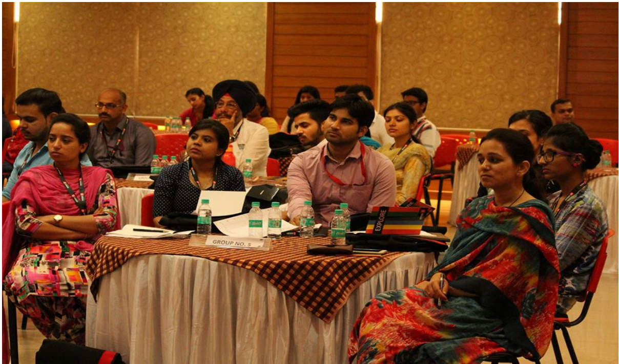
Participants listening actively during the sessions