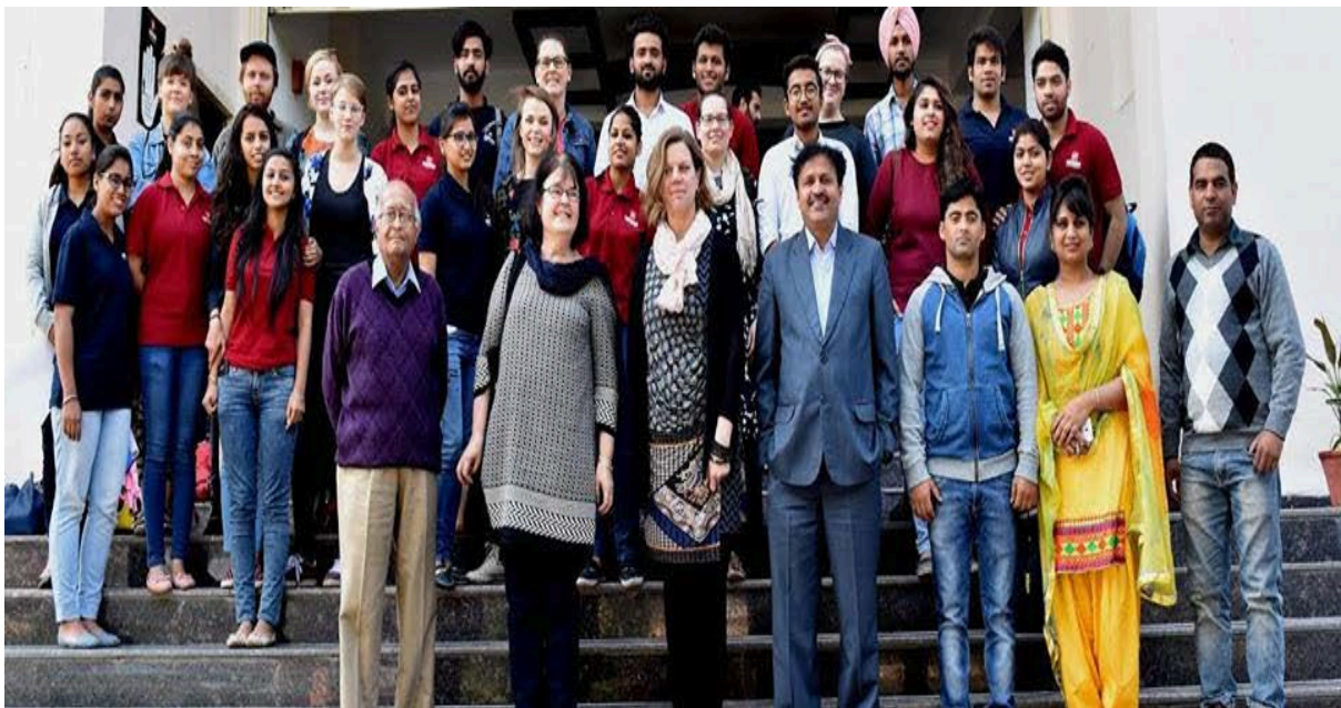
Group Photo of Faculty and students after Workshop

The faculty of media school made short films over a period of two days that were screened and analyzed by the faculty from Turku.