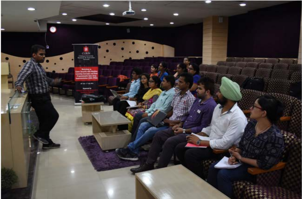
Workshop on Cyber Security with Machine Learning concepts and Field Programmable Gate Array Implementations (CML-FPGA)