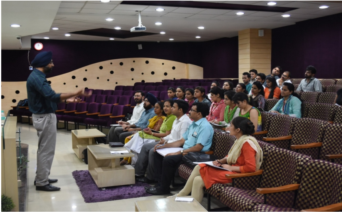
Workshop on Organizing Research: From Concept to Dissemination