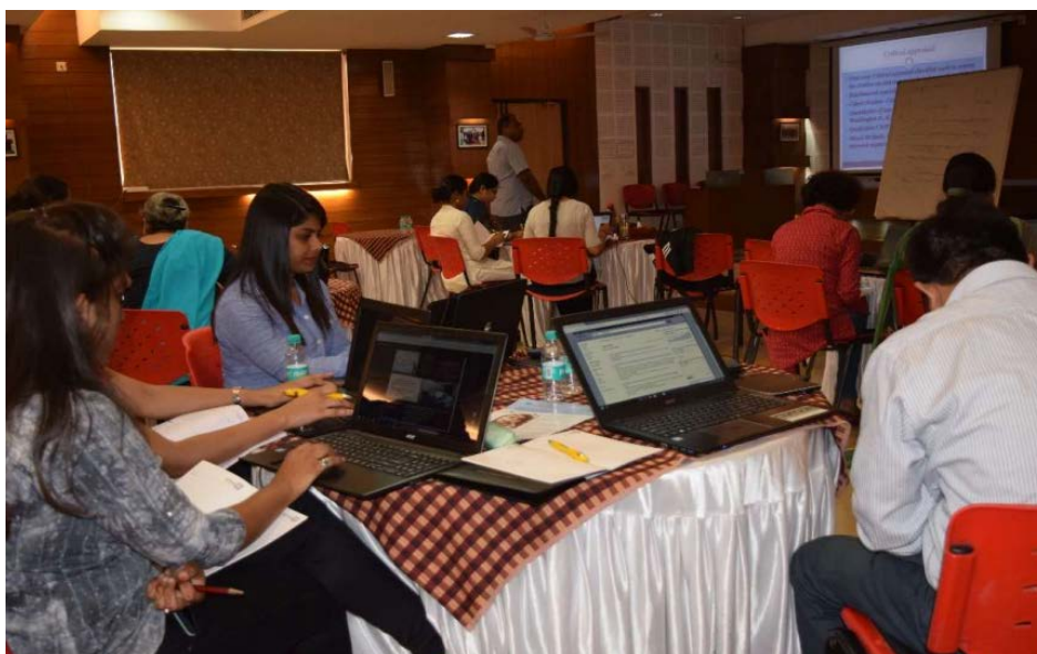
Current Trends in Neuro Rehabilitation based on Neurodevelopment Treatment (NDT) Principles