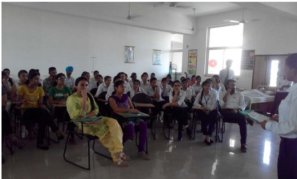
Workshop on Ventilator