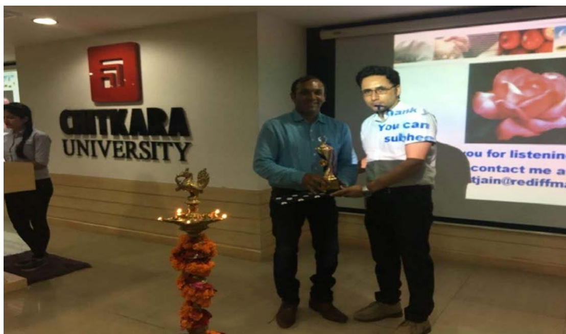
Felicitatation of guest of Honor in Pharmacy Practice Module –II at Chitkara College of Pharmacy, Chitkara University, Punjab