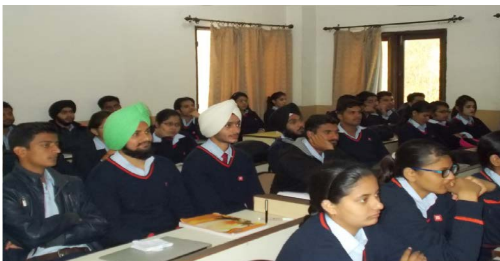
Workshop on JAVA USING ECLIPSE IDE