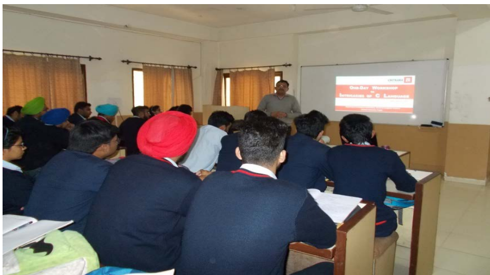
Students interacted with faculty member