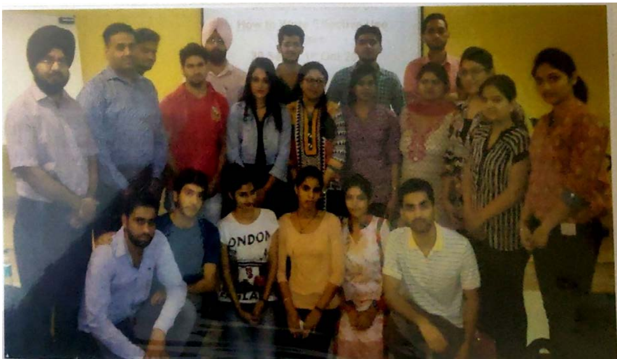
Group picture of the event "How to write effective use cases"