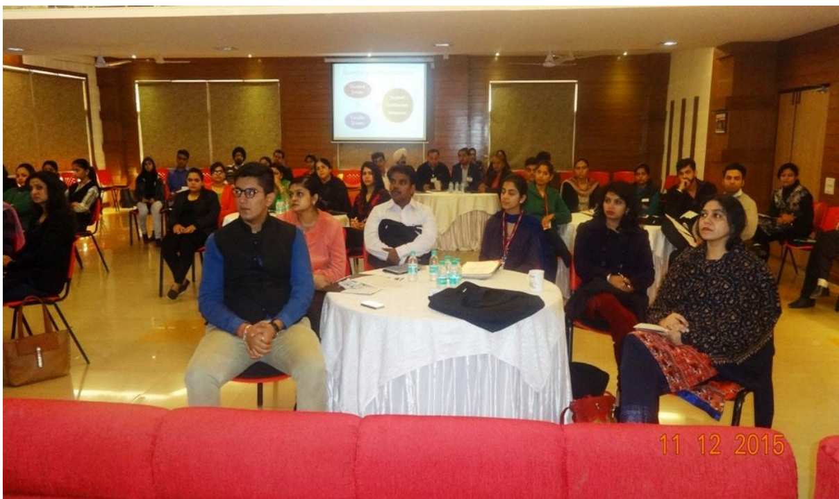
A glimpse of the workshop