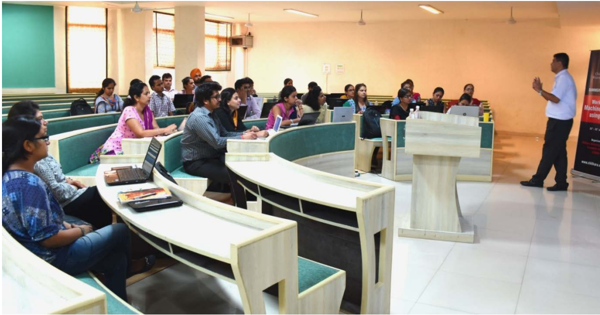
Workshop on Machine Learning using WEKA