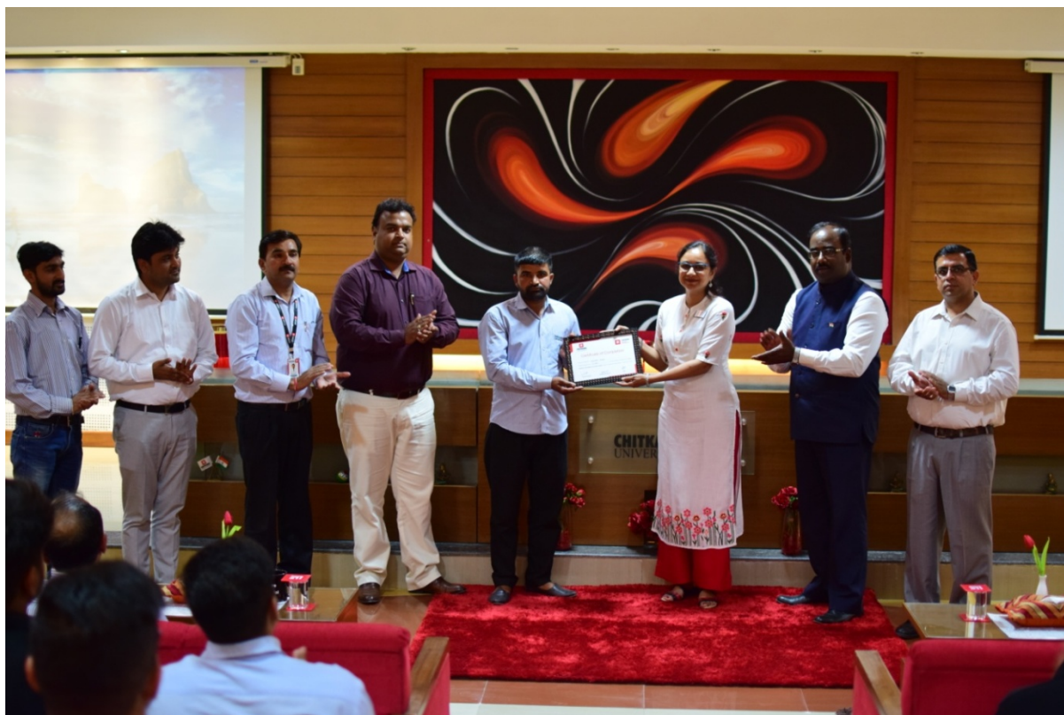
Facilitating the delegates from S. L. consultants