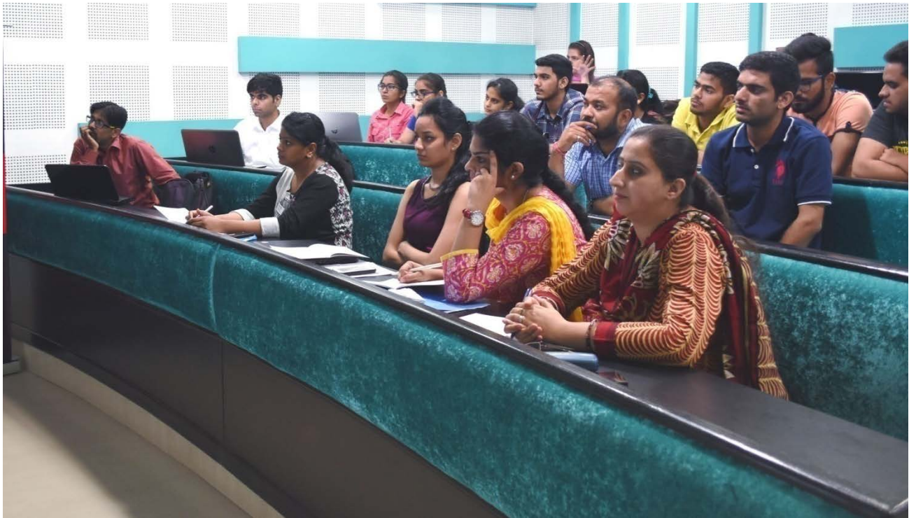
Workshop on Speech and Natural Language Processing