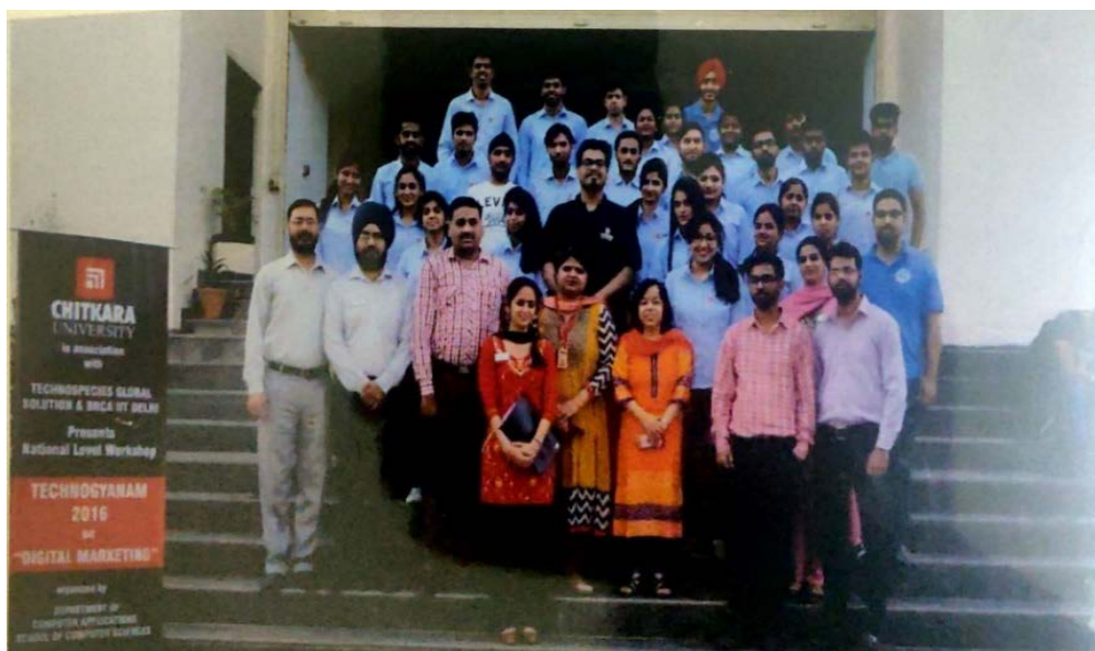
Group photo of Workshop on TECHNOGYANAM - 2016

Department of Computer Applications, CUIET, CU Punjab, in association with Techno Species Global Solution and BRCA IIT Delhi, organised a two-days National Level Workshop "TECHNOGYANAM 2016" on 7-8 April 2016 on the topic "Digital Marketing". The workshop was attended by more than 30 participants from various branches of B.Tech, MCA and BCA. The expert gave an insight into the various aspects involved in optimization of websites and emphasized on the role of an Analyst in the field of Digital Marketing. A competition among various teams comprising the participants was also held. The winning team will be representing Chitkara University at national level competition to be held at IIT Delhi. The workshop was a huge success with very good feedback from the participants.