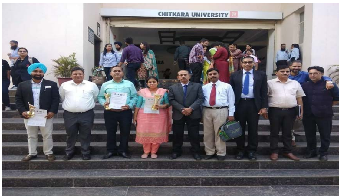
Faculty participants in Pharmacy Practice Module –II at Chitkara College of Pharmacy, Chitkara University, Punjab

excluded. All the participants were felicitated with certificates. The mega event ended with a great enthusiasm to meet again in next module.