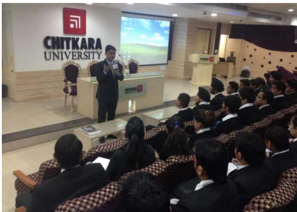
CCHMC students attended session very meticulously