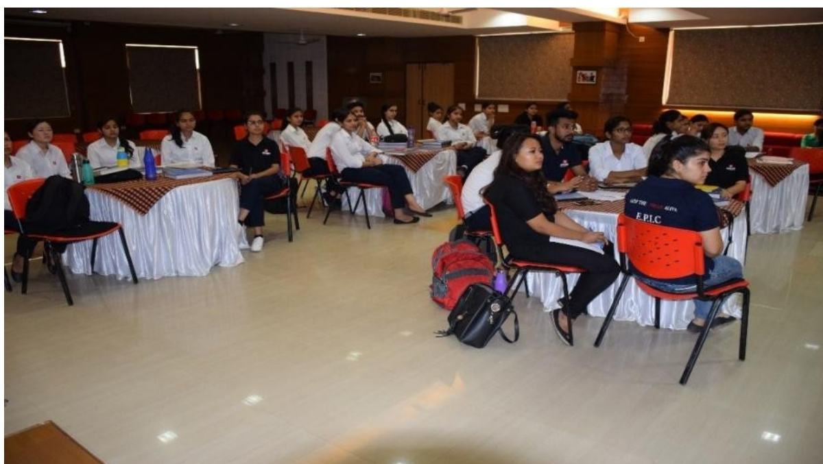
Workshop on ECG for Nurses