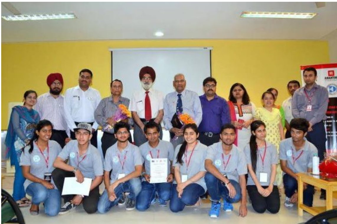
Certificate Distribution to the student