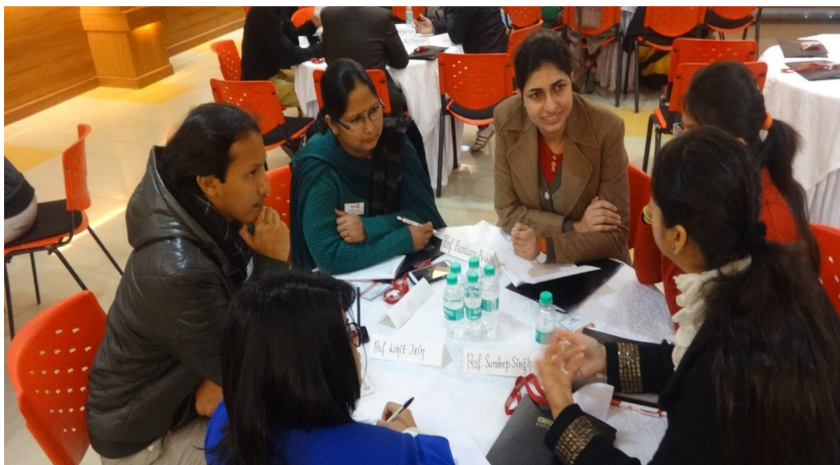
Discussions during the sessions