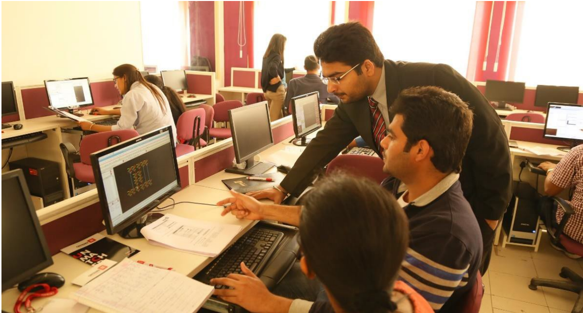
Hand-on Session during the Workshop