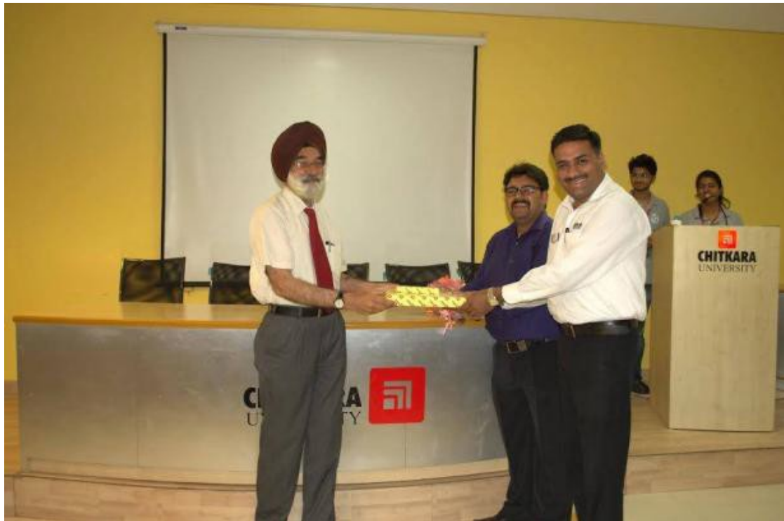
Honorarium to Resource Person