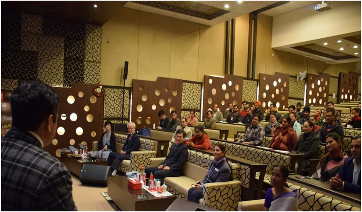
Training programme on Housekeeping (20-12-2014 to 30-12-2014)