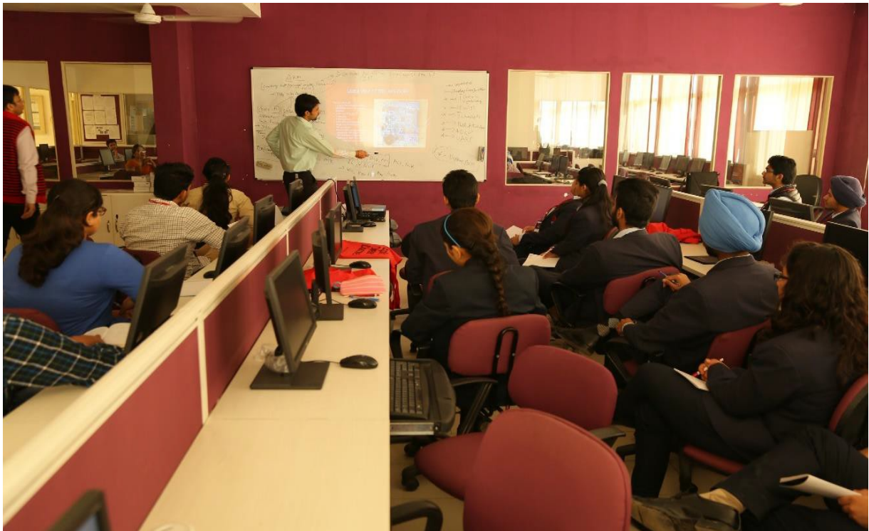
Participants Attending the Workshop