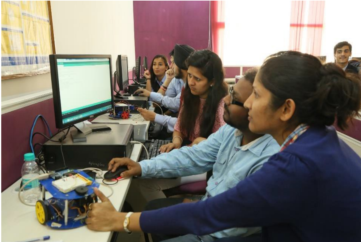
Hands-On Practice Session