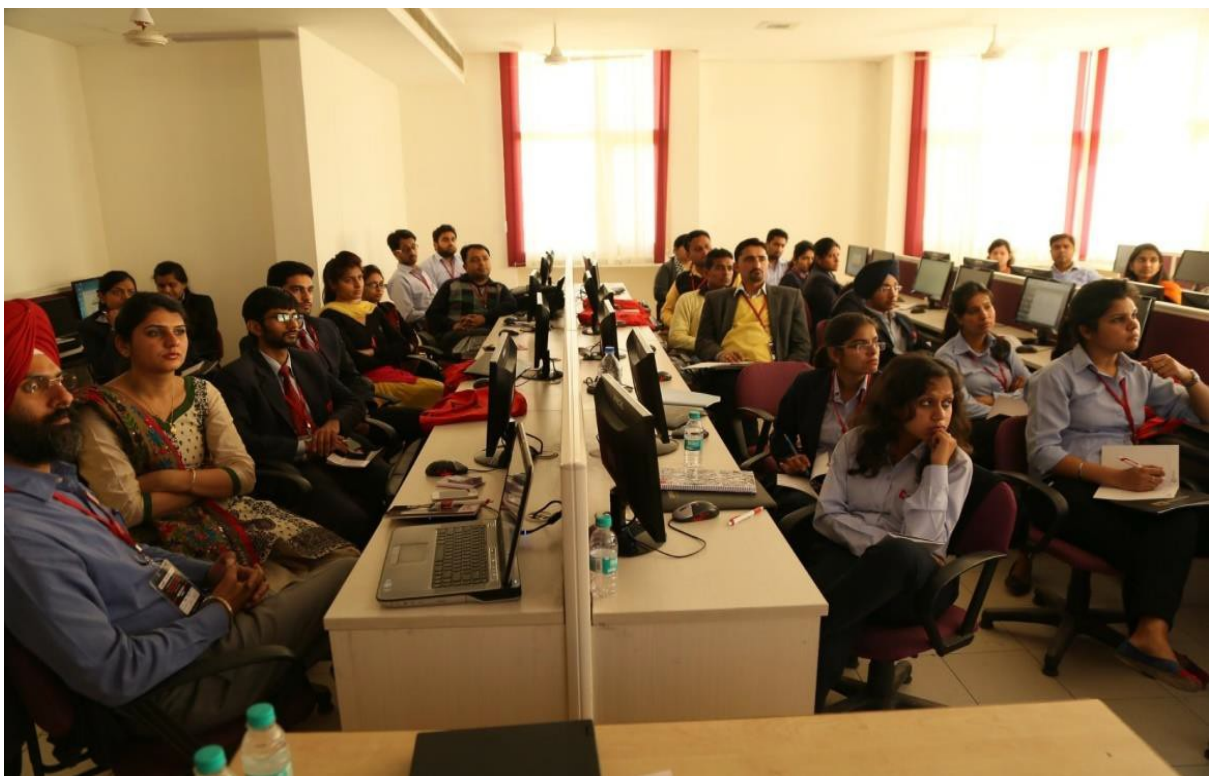
Workshop on Embedded Systems Design using MSP430 Puppy

Description of the event: Department of Electronics and Communication has organized a two days conference for the faculty members and students. Under the Conference, five workshops were offered by the department. The workshop registration is free for the students. Out of various departments, 11 faculty members registered for the workshop. The main focus of the workshop to enlighten the audience about the various features of MSP430 using MSP430 Puppy Kit.