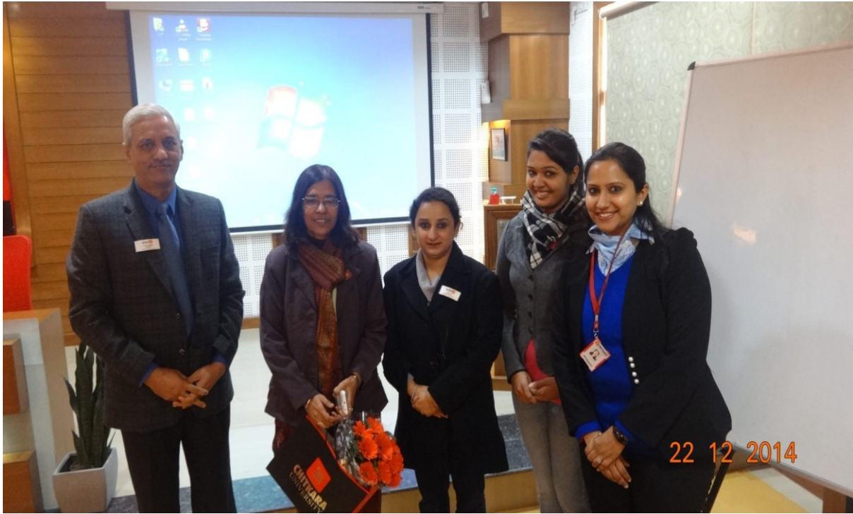
A glimpse of the workshop