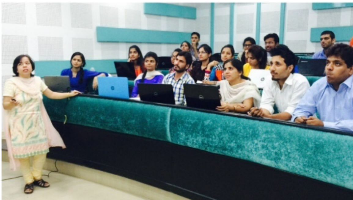
Students attending CORE JAVA workshop