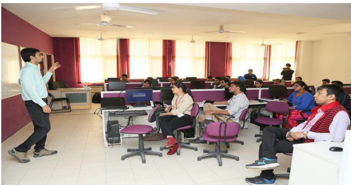
Workshop on ARM based Embedded Processing using Stellaris Guru

Description of the Event: Department of Electronics and Communication has organized a two days conference for the faculty members and students. Under the Conference, five workshops were offered by the department. The workshop registration is free for the students. Out of various departments, 15 faculty members registered for the workshop. The main focus of the workshop to provide the knowledge about the ARM based embedded processing using Stellaris Guru. Stellaris Guru is based on LM3S608 microcontroller family from the TI Stellaris600 series. This kit has user programmable, push buttons and ultra-bright LEDs, both unicolor and RGB including Reset pushbutton and power indicator LED. This kit has inbuilt standard ARM 20-pin JTAG debug connector, Arduino compatible interface connector, UART0 accessible through a USB virtual COM port (VCP), programmable through UART using preinstalled boot loader and USB interface for all communication and power.