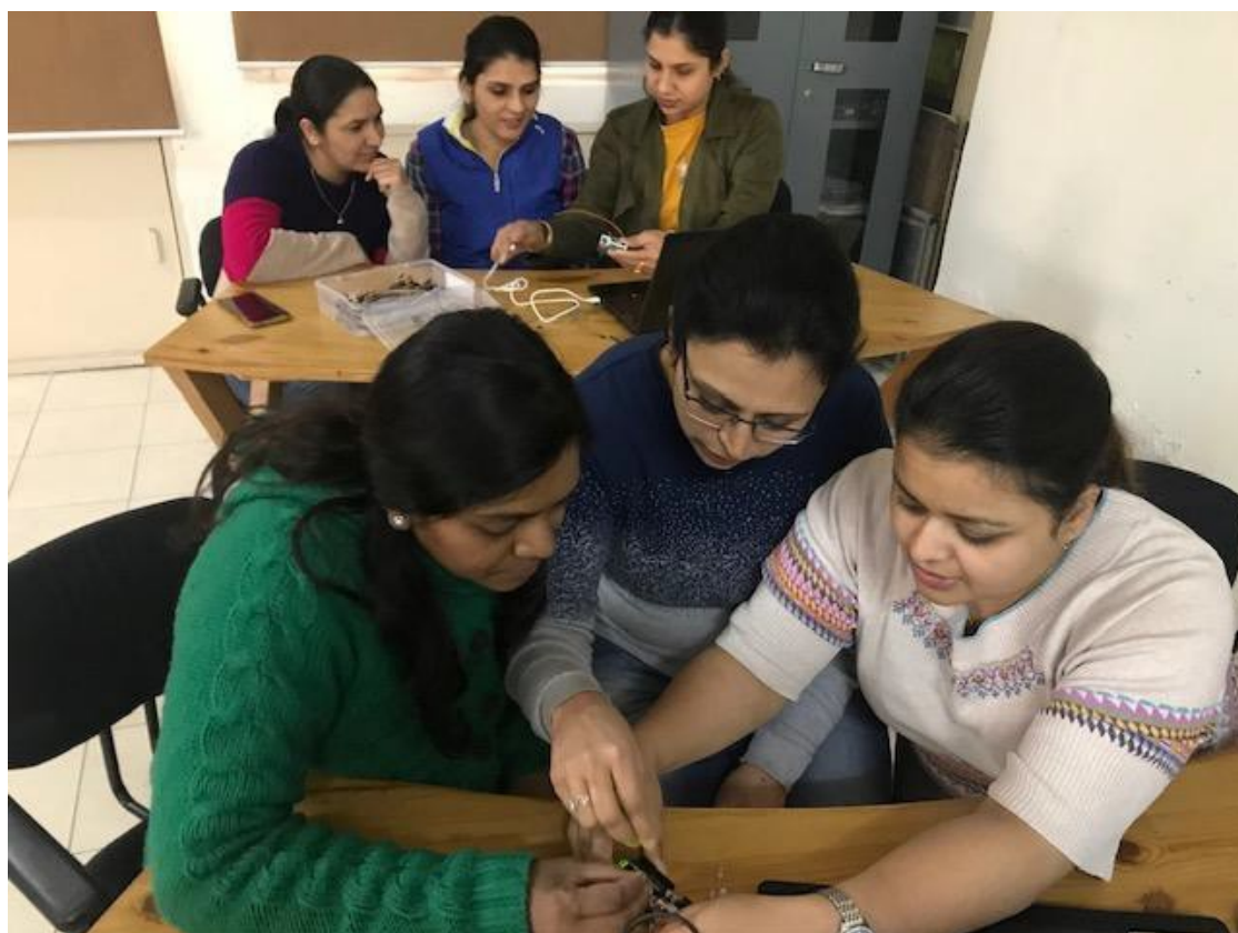
Workshop on Robotics using Arduino

Description of the event: Department of Electronics and Communication Engineering has organized a two days workshop on Robotics using Arduino. 22 faculty members from the department participated in the workshop. Participants learnt to build a Robotic Arm with 3 degrees of freedom which could be controlled by a smart phone using an Android App. By building this project, faculty learnt about Arduino programming, working of the servo motors which act as actuators and Bluetooth communication.