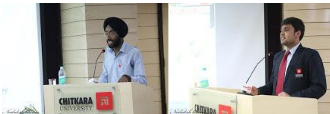
Student participants presenting their ideas during the workshop