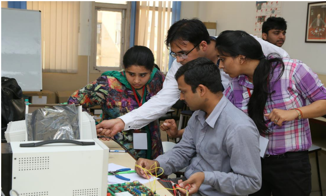
Hans-on Session during the Workshop

Description of the Event: Under WECON conference, one of the workshop offered by department of electronics and communication engineering is on Analog System Design in Embedded System. 10 participants from the department has attended the workshop. The main focus of the workshop is to provide the knowledge of basic components used in embedded system. The session provides the hands-on exposure of Analog System Design to the participants. Participants used Analog System Lab Kit (ASLK) from Texas Instruments as a platform to provide hands-on training. They simulated the analog systems using TINA software using macro models of analog ICs and then verify the designed circuit through bread board.