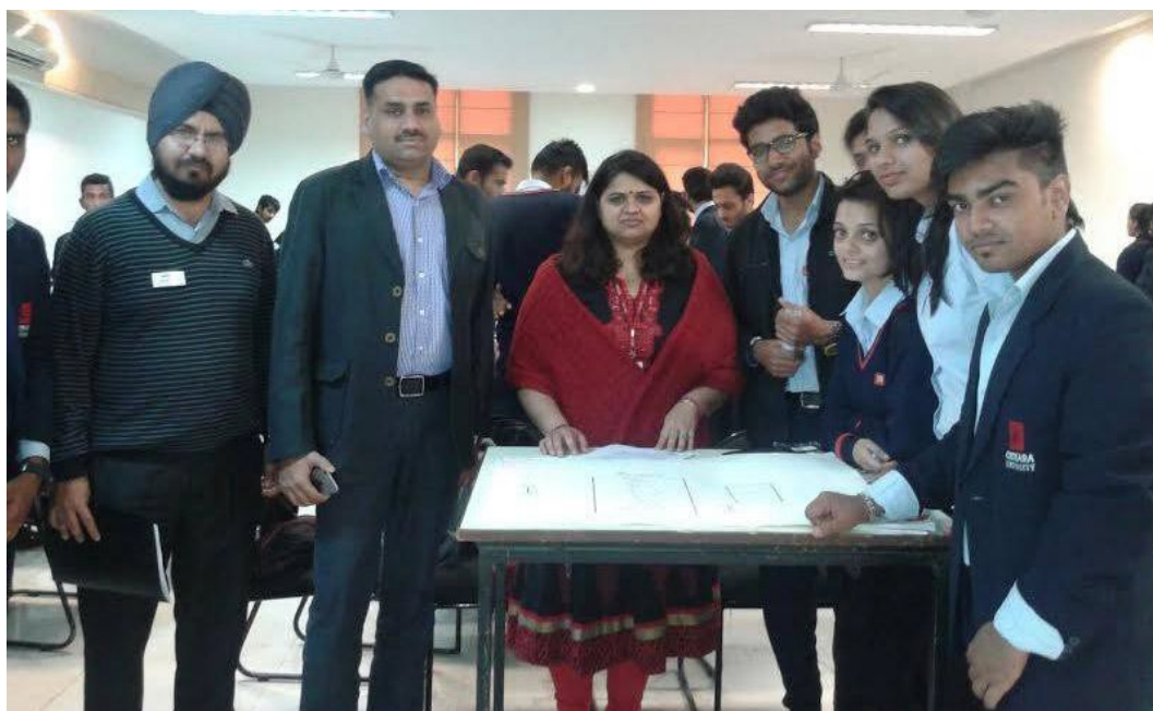
Organised a workshop on Software Development for BCA Students