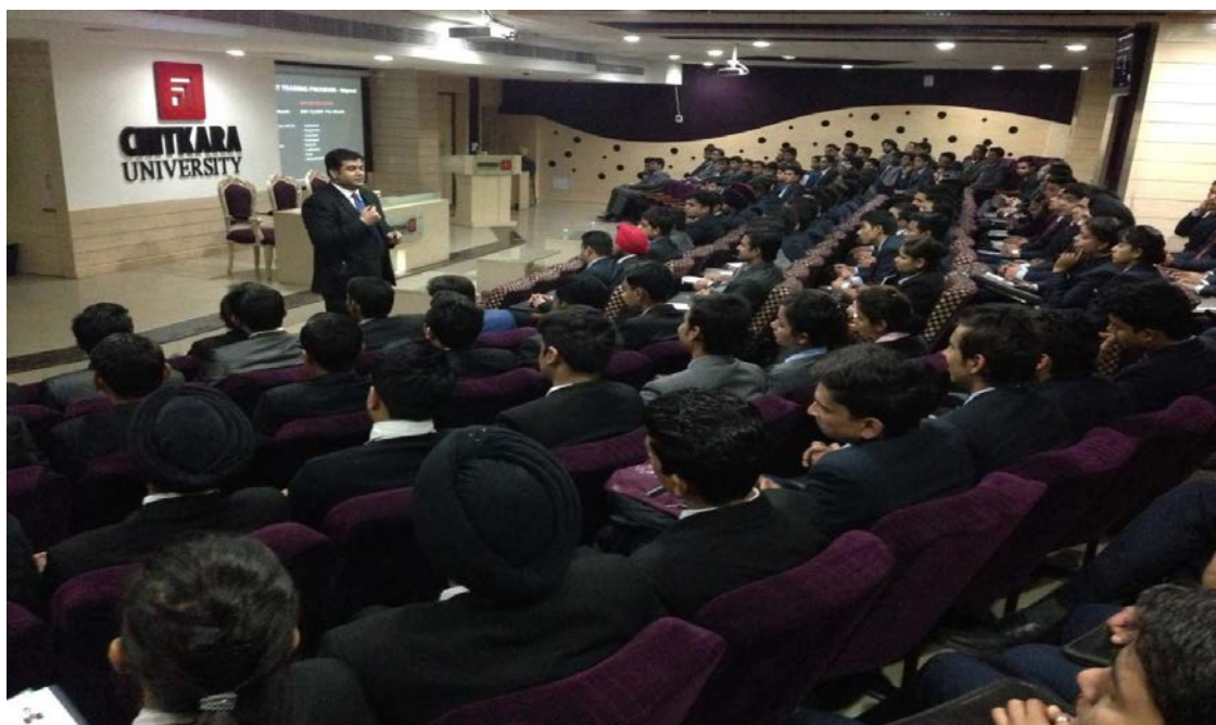
Students attended session very conscientious