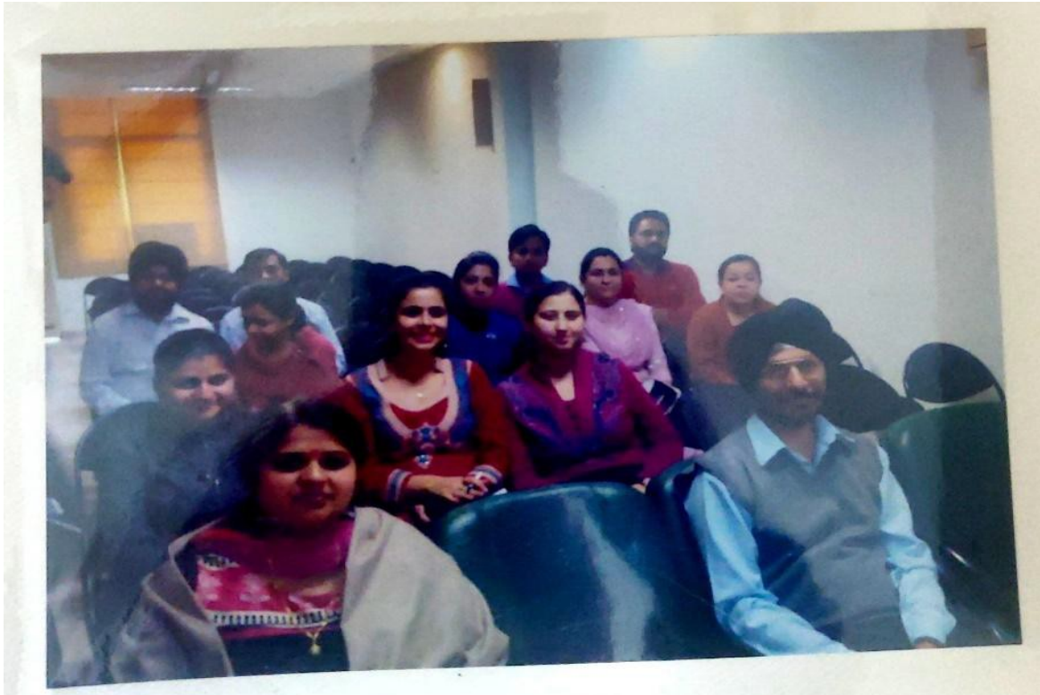
Listening to the speaker