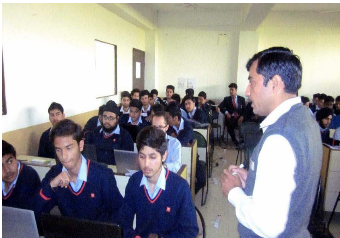
Handling queries of BCA students about CISCO simulator