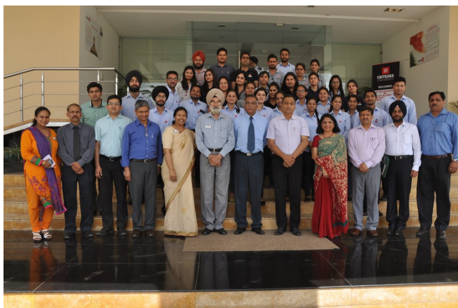
Three Day Workshop on NABH Training Certification Workshop