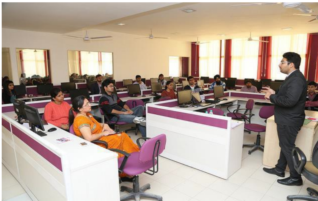
Workshop on VLSI Design using Cadence Tools Suite

Description of the Event: Department of Electronics and Communication Engineering has offered hand-on session on VLSI design using Cadence Tools Suite. 12 participants has participated and taken a benefit from the workshop. The workshop provides hands-on experience on the state-of-the-art Cadence EDA tools for VLSI Design. The participants had an exposure to the Circuit Design, Simulation, Layout, Physical Verification (DRC, LVS) and Extraction. The workshop included practice sessions on the Cadence design and simulation tools (Encounter, RTL Compiler, Virtuoso, Spectre, Assura and Incisive).