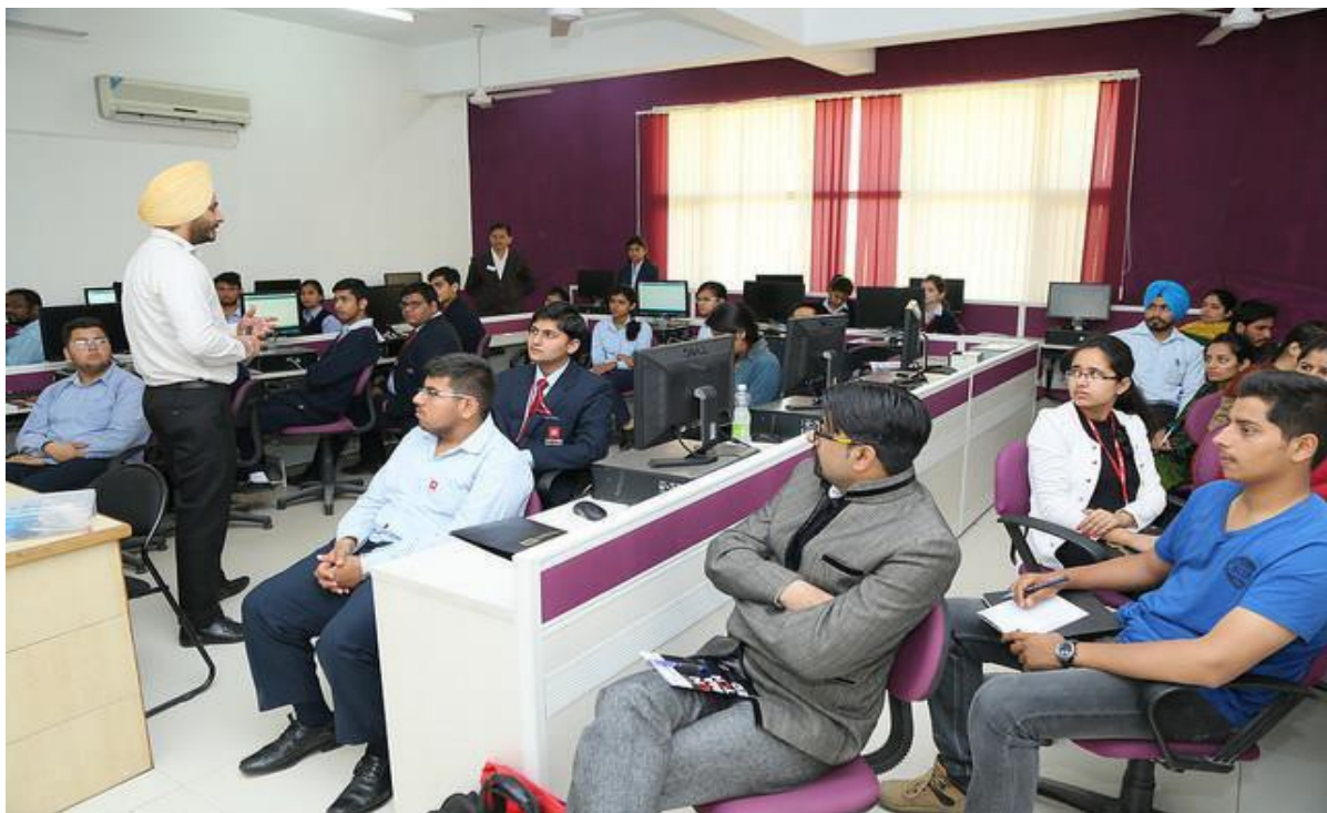
Hands-On Workshop on Arduino and Intel Galileo

Description of the Event: Department of Electronics and Communication Engineering has offered hand-on session on Arduino and Intel Galileo. The workshop was focused on getting up and running with Arduino and Intel Galileo quickly, so the faculty was able to understand the basic procedures for working with Arduino. The workshop was purely hands on approach and aimed to getting familiarity-of-use with commonly used components in robotics projects.