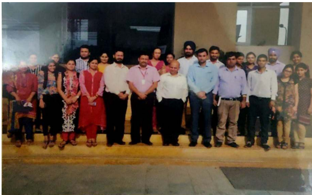
Faculty Development Workshop on C Programming Language