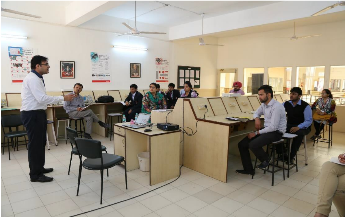
Workshop on Analog System Design in Embedded System