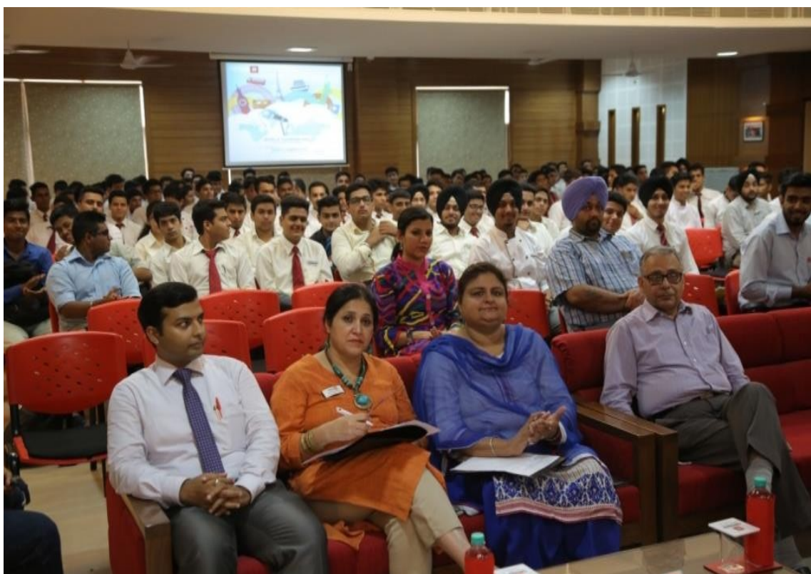
Students participating in the training programme of tourism and hospitality