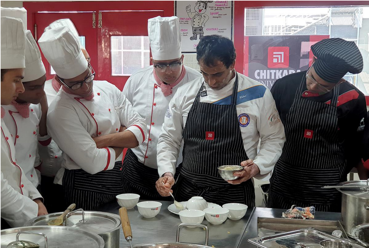
Chef sharing his experience with CCHMC students