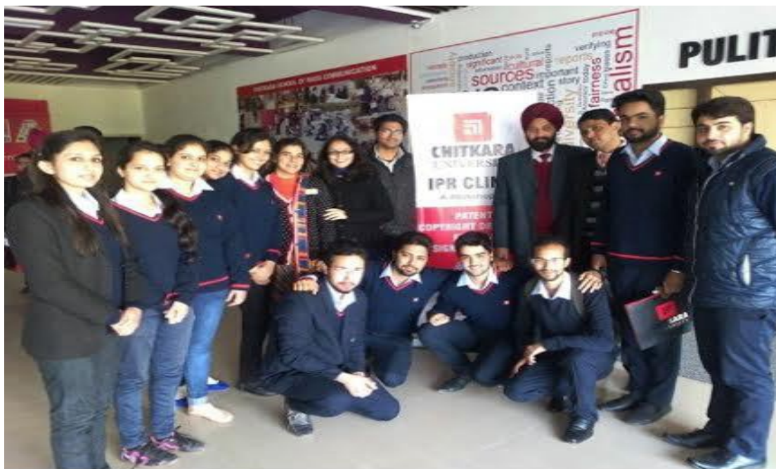
Students and Faculty members during the Tea Break

Total 40 participants were present during the workshop.