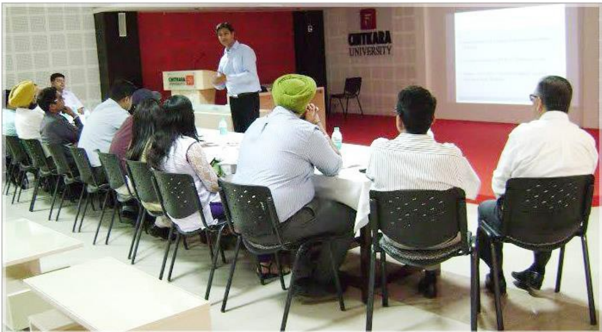
Faculties while attending training programme

The aim of organizing this training program is to equip faculty members of CCHMC with contemporary industry, teaching and culinary skills that help to chefs while imparting skills to students.