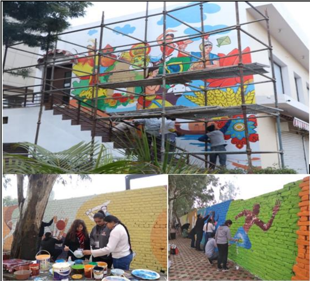
Figure 2. Wall mural project in Chitkara University, Punjab during 'TOXICITY' International Alternative Art Symposium, Mentored by Dr. Arjun Kumar Singh, 2020