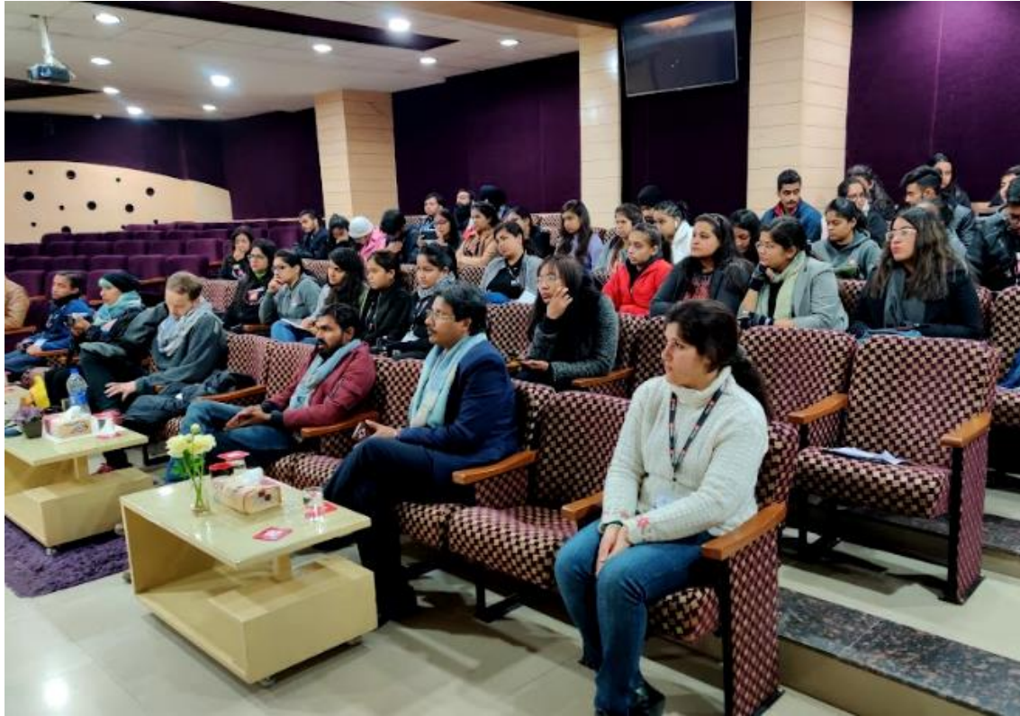
Figure 13. Discussion Session During Presentation