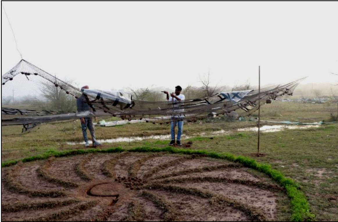
Figure 3. Installation by Intaz Ansari, Shantiniketan, WB, India