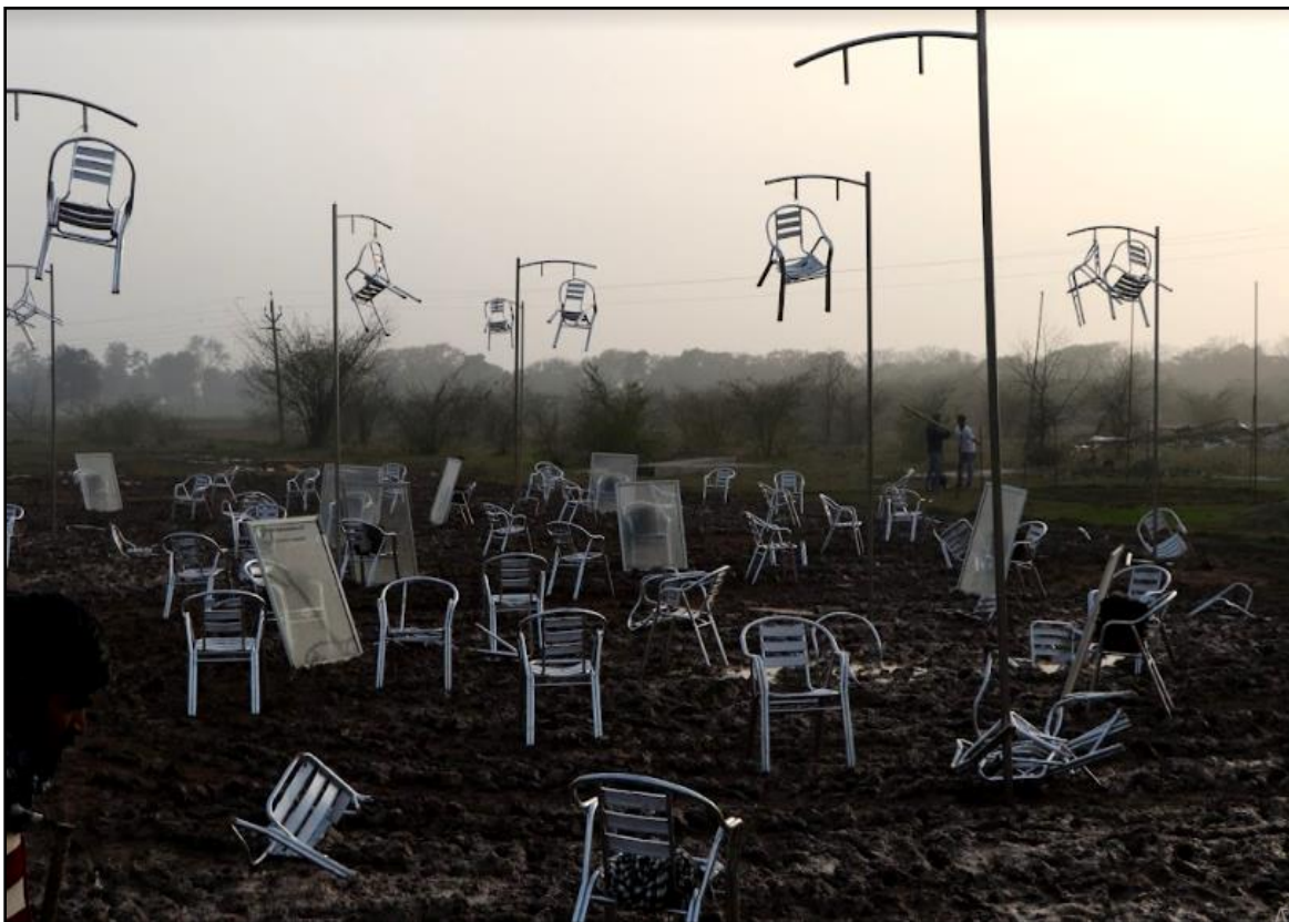
Figure 4. Installation by Kulpreet Singh and Anil, Punjab, India