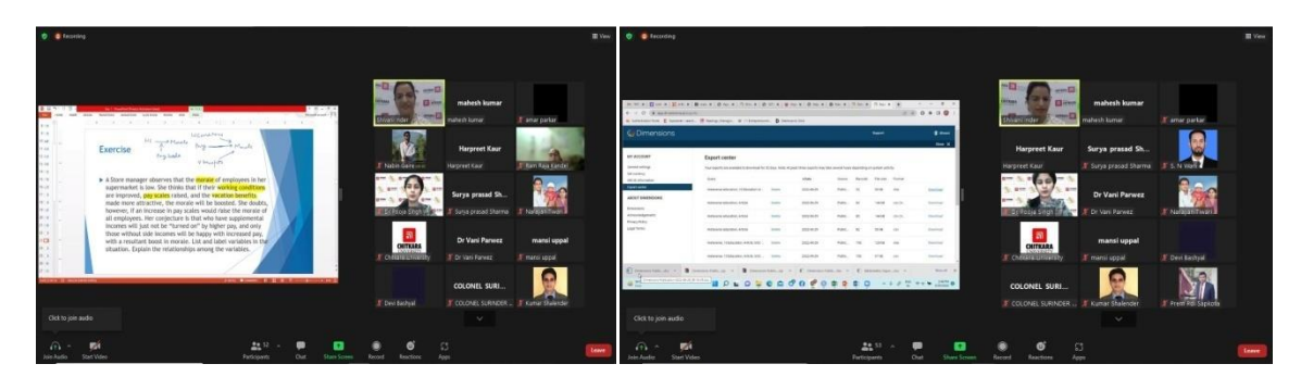
Screenshots during the event of all the days